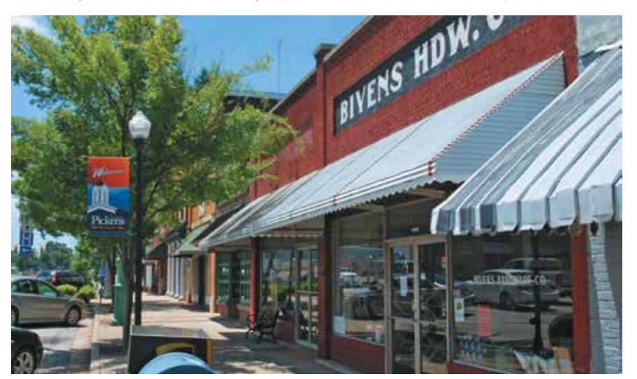
Pickens has spruced ub its downtown.

The history of this organization is a history of collaboration to help make all cities and towns engines of economic growth that power our state's economy. The articles in this issue of Cities Mean Business magazine share that story.