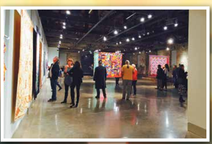
A quilt exhibit at Artfields.