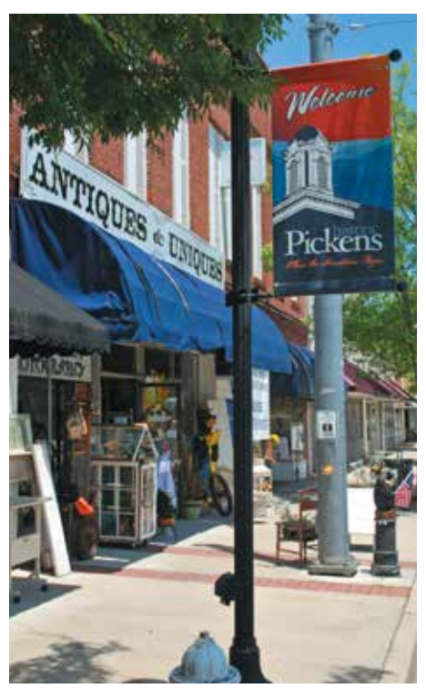
Pickens has attracted 18 new businesses.

"While the steps of the online toolkit are easy to understand, it takes hard work and