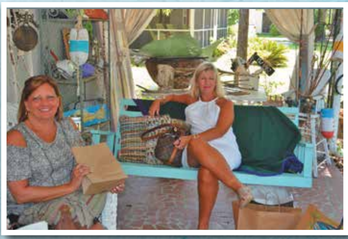
Downtown Bluffton offers a variety of shops and galleries.