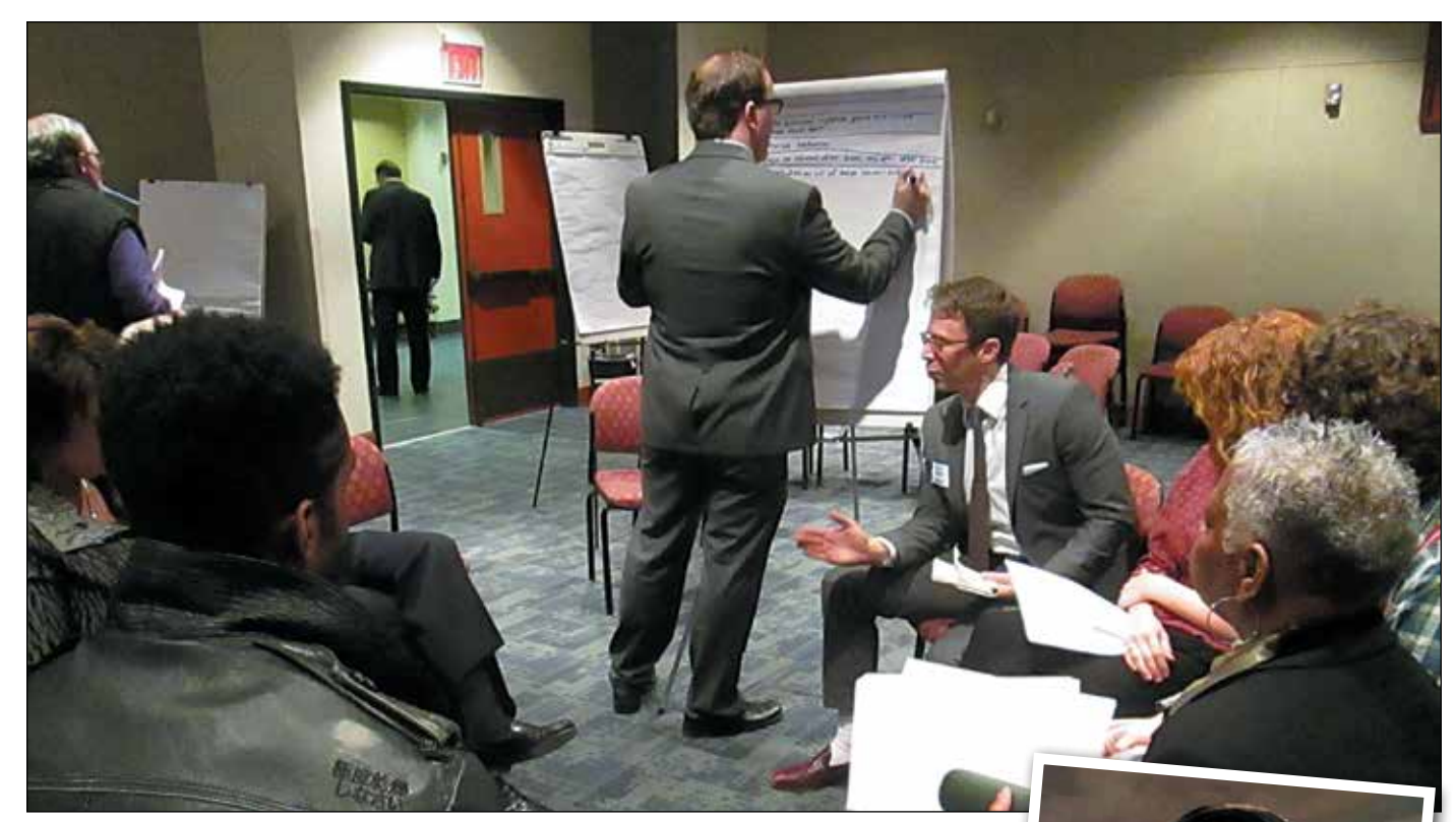
Above: Late Night Activity Public Listening Session held by the Late Night Activity Review Committee