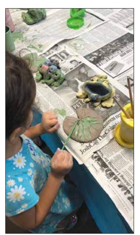
The City of Columbia arts center offers multiple classes throughout the day and evening, teaching children and adults many types of the arts.

"Art brings people to your town. They come from Columbia, from Greenwood, from Camden," said Palmer. "We are here to serve the community, and we are always looking