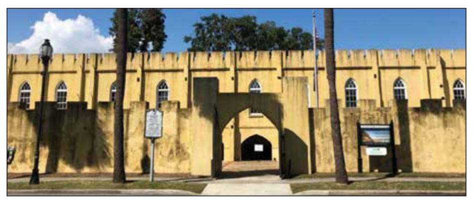
The Beaufort History Museum is located on the second floor of the historic arsenal built in 1798.

For the North Charleston Fire Museum, one unexpected big-ticket item came in the form of programming change.