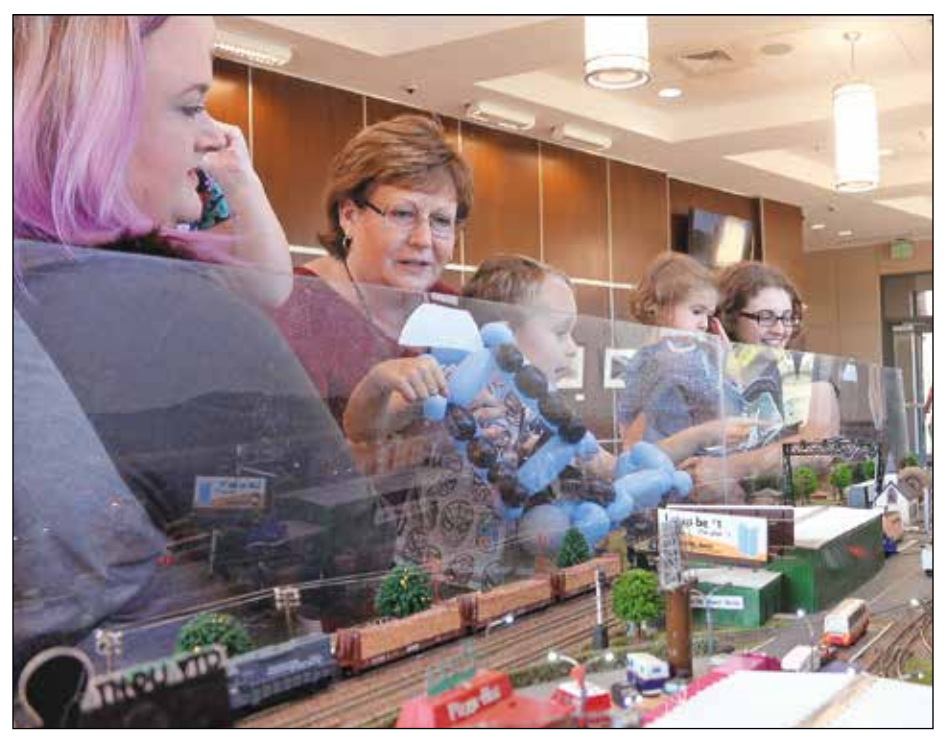
The City of Greer's RailFest emphasizes train safety for motorists and pedestrians, while featuring live music and model trains.

it's for complaints about something. But here, it's 'thank you for this event'. "