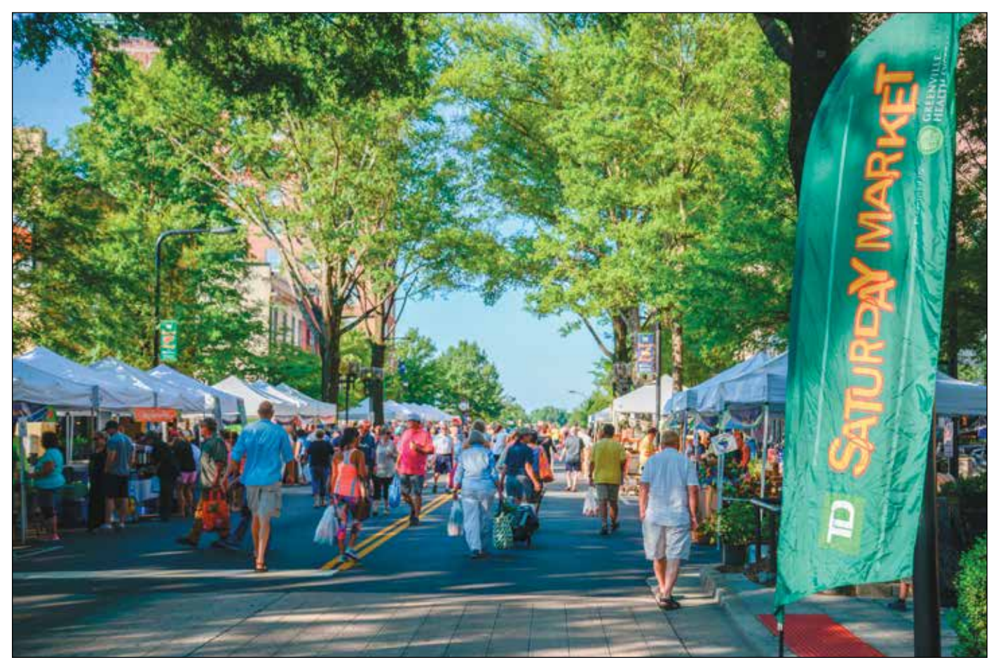
The City of Greenville's TD Saturday Market accepts vendors that meet specific standards in location and uniqueness.

"What produce do they bring? Where are they? Do we need the product? Is it unique?