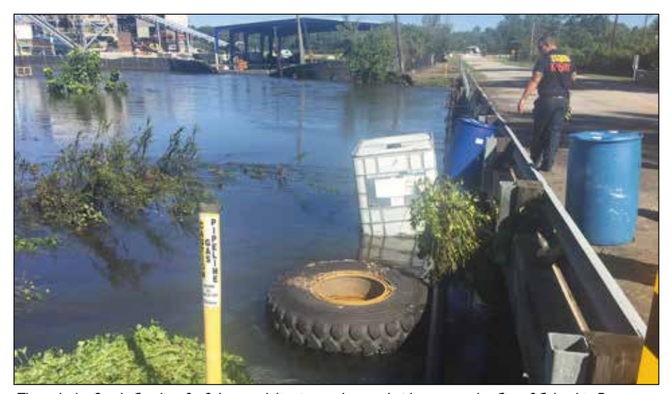
Through the South Carolina firefighter mobilization and mutual aid program, the City of Columbia Fire Department assisted the City of Hartsville and several other cities after Hurricane Florence.

"The impact of the downtown commercial district on the local economy is significant. When the commercial district is threatened by natural disaster, it's important for friends and neighbors to lend a hand — if possible, to mitigate the effects; if not, to help with cleanup and restoration. We were honored to be able to offer assistance to our colleagues in Dillon