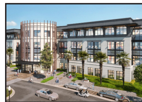
Charleston Office 2000 Daniel Island Drive, #140 Charleston, SC 29492 843.352.7770