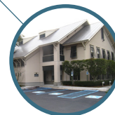
HILTON HEAD OFFICE