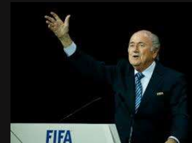
When Leaders Fail