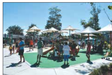
Savannah's Playground in Myrtle Beach draws families and children of all abilities to enjoy the unique amenities.

"Our city destinations have done an incredible job identifying authentic attractions they can offer to visitors," he said. "They work well with regional and state marketing organizations to promote their best attributes to the nation and the world." ●