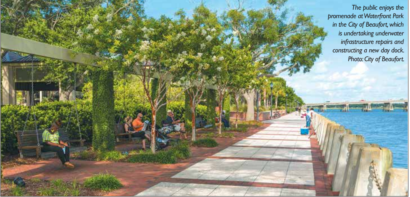
The public enjoys the promenade at Waterfront Park in the City of Beaufort, which is undertaking underwater infrastructure repairs and constructing a new day dock.