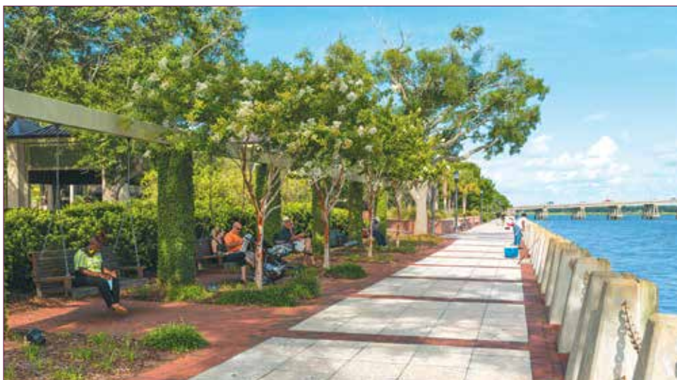
Cover Photo: The City of Conway's three-phased riverwalk project