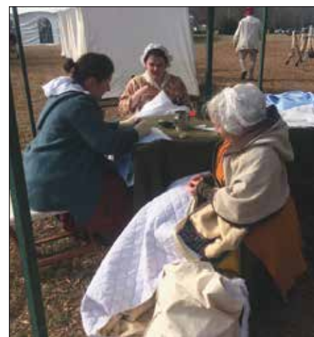
The Cowpens National Battlefield attracts history buffs, visitors researching their ancestors and Revolutionary War re-enactors, such as these women in period attire.