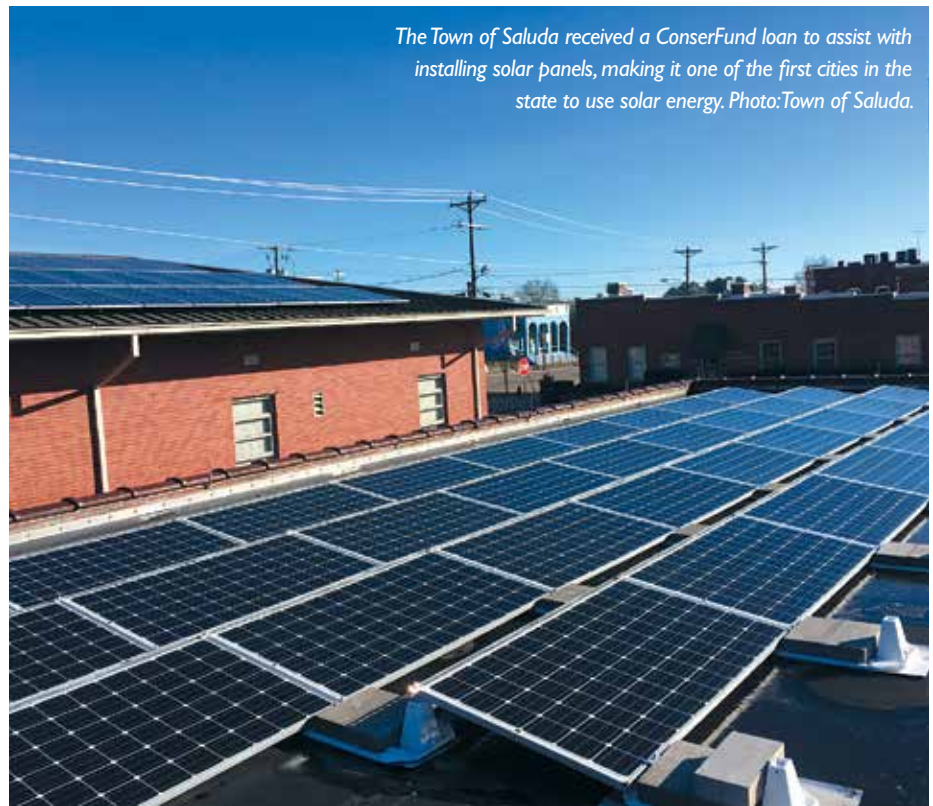
The Town of Saluda received a ConserFund loan to assist with installing solar panels, making it one of the first cities in the state to use solar energy.