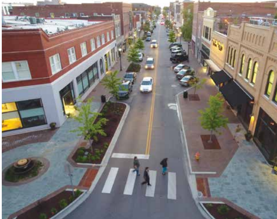
West Evans Street in Florence has been the site of many building rehabilitations and business openings in the past decade.