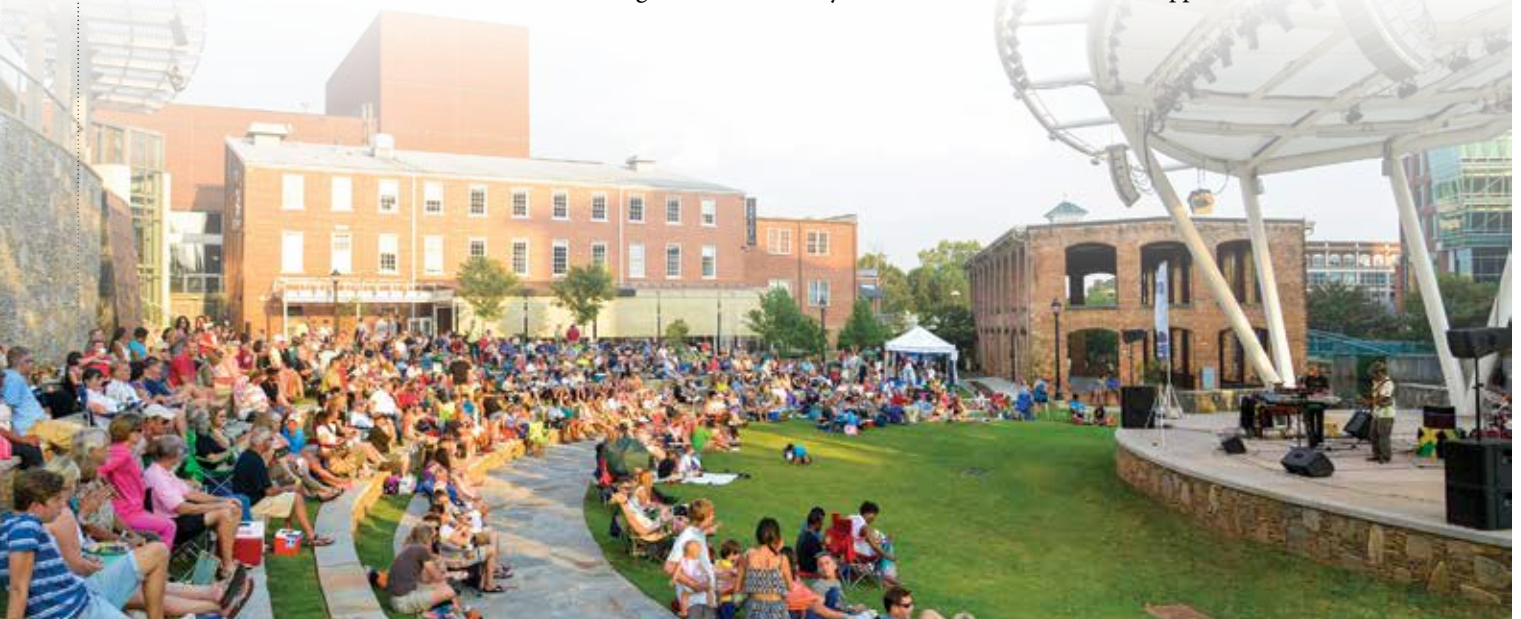
Families enjoy weekly concerts throughout the summer at the Peace Center Amphitheatre in downtown Greenville.