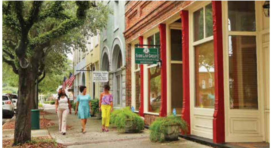
Kingstree is one of the newest participating communities in Main Street South Carolina.

"Cities and towns hoping for a revitalized downtown, like the success stories we've already seen around South