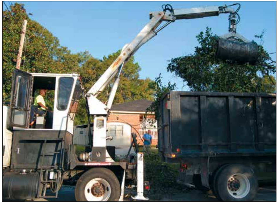
Goose Creek public works employees use rear-loading trucks.

The town also deploys a street sweeper to remove leaves that flutter into the gutter along its 14 miles of curbed roads, Padgett said. Leaves in parks and common areas around town are raked or blown into a pile and trucked to the