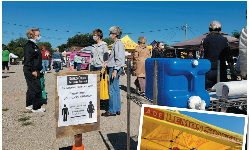
The Kershaw County Farmers Market began providing social distancing precautions to allow residents to continue accessing fresh produce and other essential products.

"The majority of our eating establishments went straight to curbside pickup and local delivery when their dining rooms were closed down by the governor's executive order," Spadacenta said. "Some of our lunch locations also began preparing family-style 'heat and eat' meals for people to take home. Our retail boutiques took their inventory to social media, offering Facebook Live sales and FaceTime or video chat tours of their shops. Many offered front-porch delivery to Camden residents. Our bookstore recorded a 'story time' with a local author