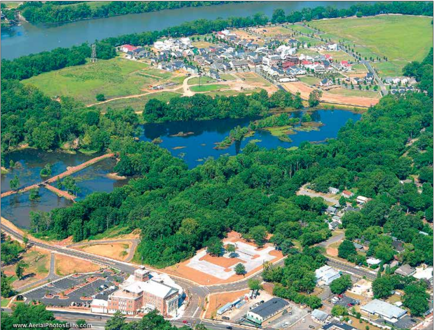
Savannah River/North Augusta