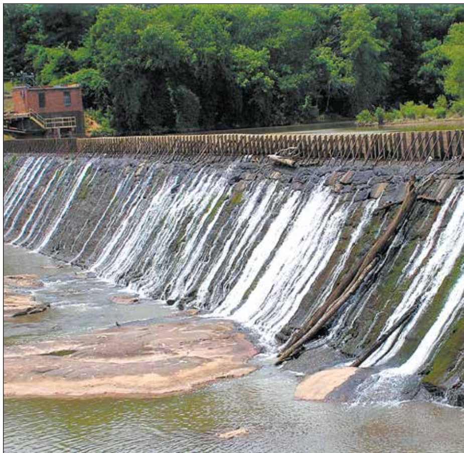
Saluda River/Ware Shoals

For years, there was no public access to the river, due in part to industrial sites located there. The town reached an easement agreement with Lockhart Power,