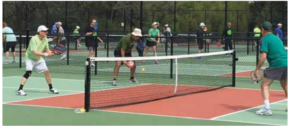
The 12 courts of Camden’s Pickleball Plaza are converted tennis courts.