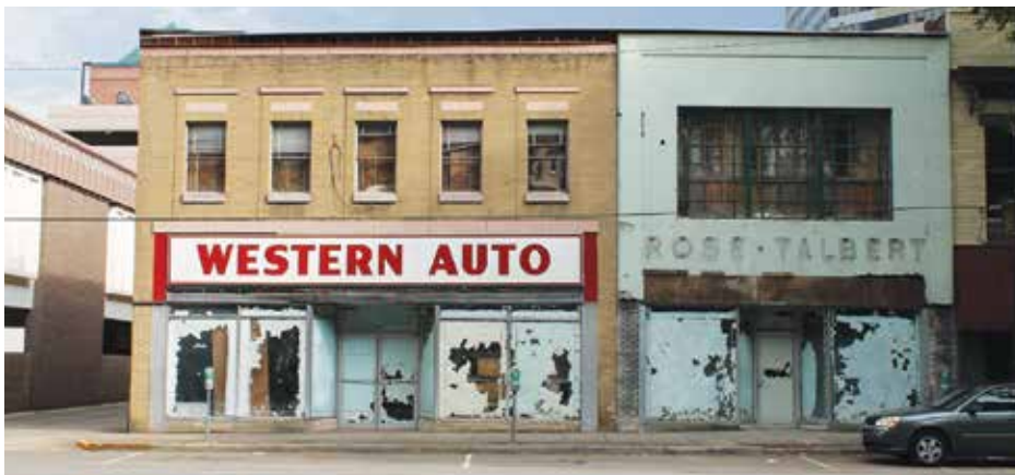
The Western Auto building (1940) and Rose-Talbert building (1914) in downtown Columbia stood vacant before they were renovated together in 2018.