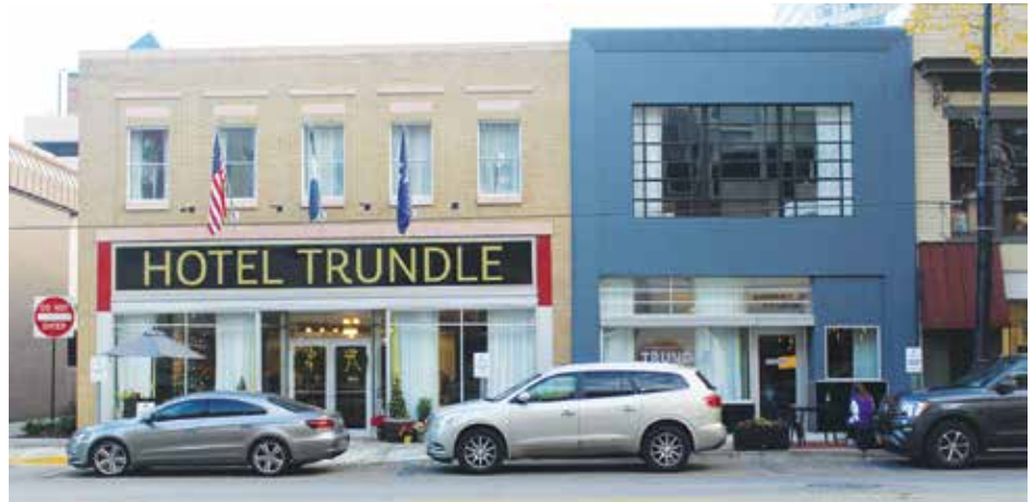
The new space for Hotel Trundle and the BOUDREAUX design firm made use of incentives including the Abandoned Buildings Revitalization Act, the Bailey Bill, tax credits and façade easements.

When seeking a property tax credit from a municipality or county, the governing body must determine and certify the