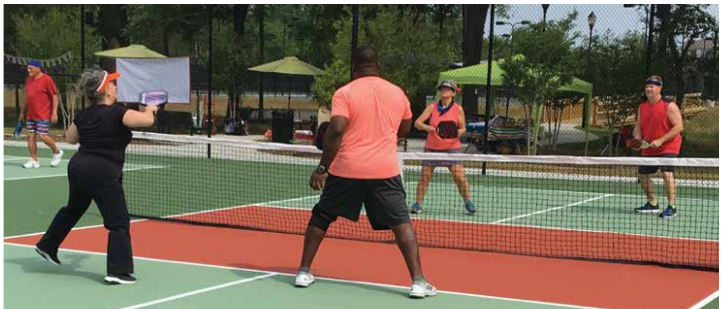
Pickleball uses courts set up with the same dimensions as a badminton court, with a 36-inch net.

“The course is challenging enough for the more advanced players and enjoyable for those who are just beginning,” Cook said.