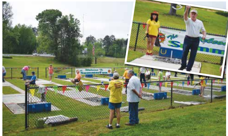
Newberry serves as one of four stops for the SummerFun Horseshoe Tournament each year.

“We’ve gotten where we have enough staff to be able to handle two different