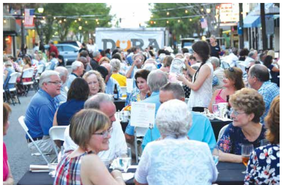
2019 marks the third year of the Downtown Orangeburg Revitalization’s Taste of the Market event.

The process also considers affected business owners. DORA notifies businesses of street events at least 30 days in advance of the dates and times. A street dance that begins at 6 p.m. actually begins with a road closure starting at 3 p.m. to allow for the setup of things like food trucks or light-stringing. DORA also announces street closures on social media, typically with a map showing where the event is happening and where visitors can find parking.