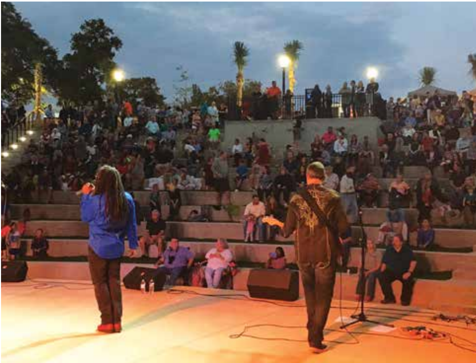
Icehouse Amphitheater takes its name from an ice plant that operated at its site from 1928 – 2012.

He said that event management at the venue has enjoyed the benefits of buy-in from across the Town of Lexington’s leadership, working with the Police Department for security as well as Parks and Sanitation for cleanup.