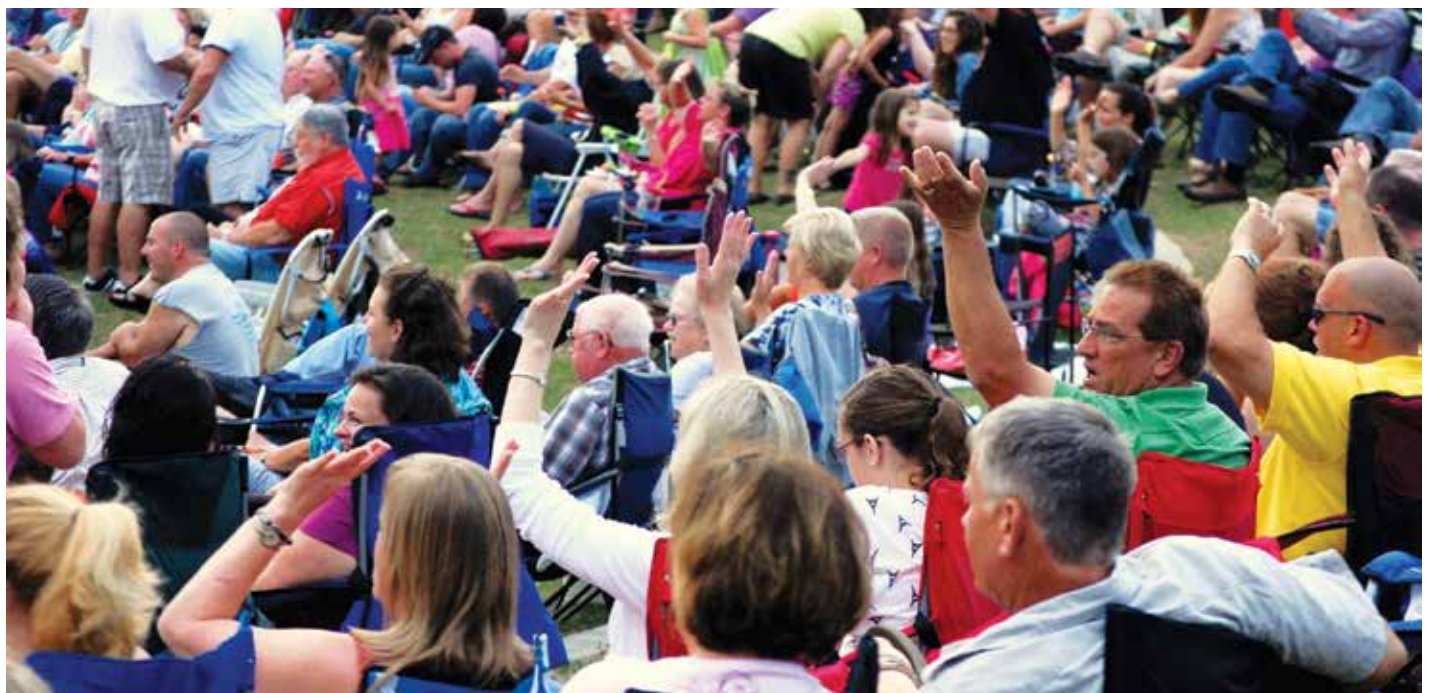
Trailblazer Park is home to concerts, movies, festivals and the Travelers Rest Farmers Market.

The Icehouse Amphitheater books and promotes its own events — things like concerts and movies — but it also rents out the space for private promoters to handle events. Adding together both categories, Brewer said, the venue is averaging a little more than 50 events per year.