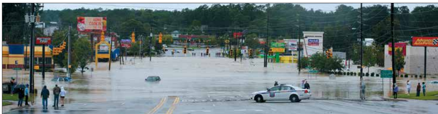
During weather emergencies, officials use GIS to map damage, track responses and allocate resources. (Columbia flooding in 2015).

"As technology has developed, GIS has become a major decision-making tool," he said.