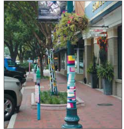
A yarn bombing decorates Columbia's Main Street.